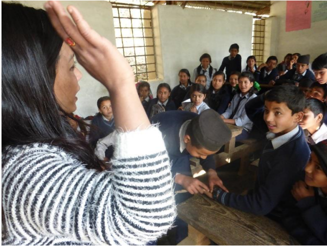
Livelihoods Sessions in the School

Some of the events and projects that we organised included livelihoods sessions with school pupils and the youth club, a year 9 class project (organised by them), English lessons, creative club sessions, Women's Day Rally and Street Drama, Gender debate, School Cleanup Mission and Handicraft workshops for the mothers group and Youth Club.