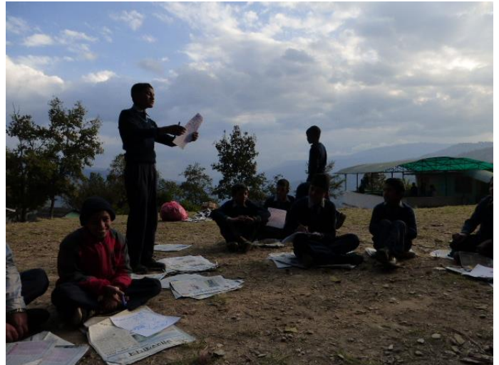
Debate about gender inequality