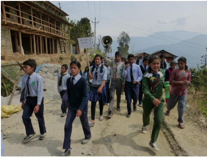
International Women's Day street rally