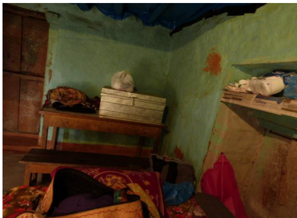
Mine and Archana's Bedroom