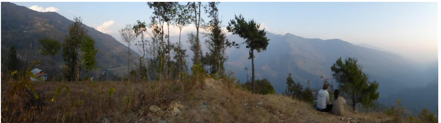
Sitting on the mountain in our free time enjoying the beautiful landscapes

If I could go back now and speak to my former self or other volunteers about to embark on their Nepalese journey I would reassure them that even though it's a long way away and the culture is a lot different to our own, the people you will meet along the way will change your attitudes and you will learn a lot about yourself while you're away too. I feel like I have become much happier and self-aware and because I worked through any problems, my confidence has grown a lot too. Waking up to such a beautiful surrounding is an unforgettable experience and I will really miss everything about my placement and the friendships I made there. Even though the bathroom facilities are frightening at first and washing clothes in a bucket is not such an easy task, it's the small moments that we often take for granted at home made it all so worthwhile.