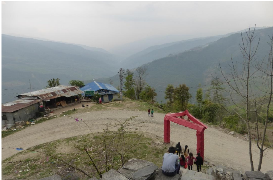
The view from the temple near by where we lived