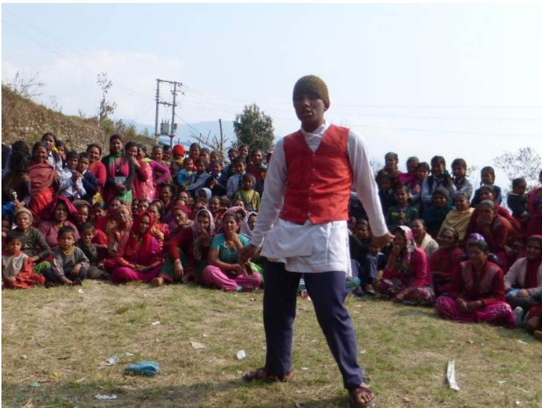
Street drama focusing on local issues including alcoholism and gender-roles