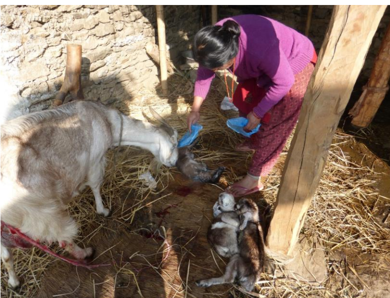
Aama: helping to deliver three healthy kids