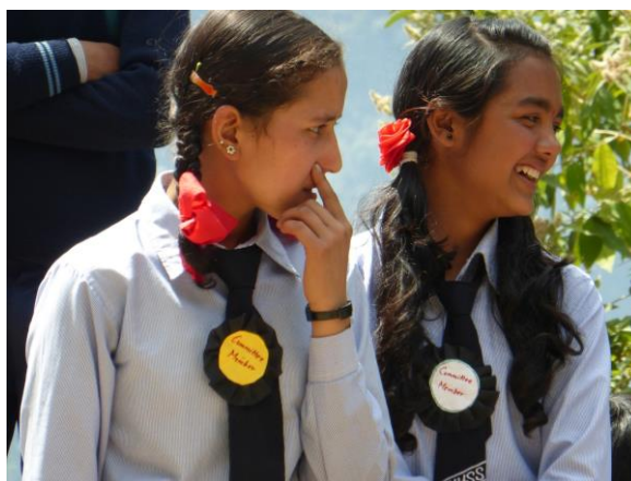
Year 9 Class Project: Committee members organising the event

We felt our Nepali counterparts had slightly more responsibility than us, as they had the duty of speaking to stakeholders and organising meetings which we sat in but couldn't understand. In the first couple of weeks we became a bit disheartened as we were constantly being compared to previous volunteers and weren't clear of what was fully expected of us. The manual that we were working through aimed to improve peoples livelihoods so we led sessions on C.V writing, vocational training, financial management and budgeting. We had been leading these sessions every day in the school but no one had seen what we were doing and suddenly we were being told that we weren't as 'active' as previous volunteers. We decided that we needed to hold more events so that the hard work we were doing didn't go unseen.