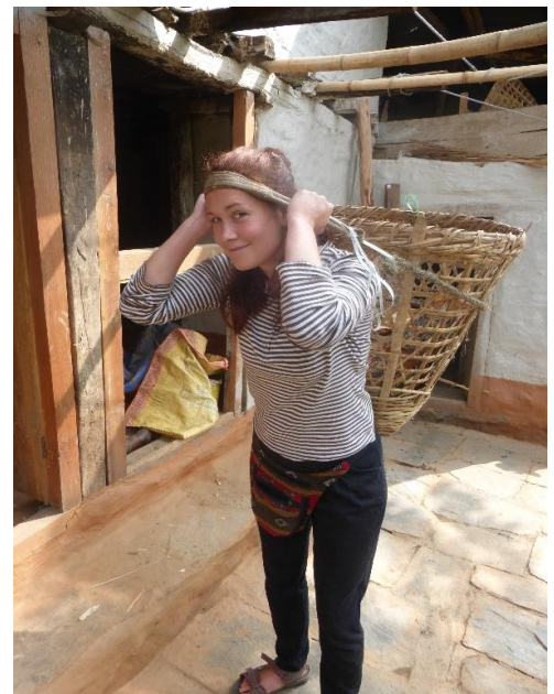
Me: Testing my strength