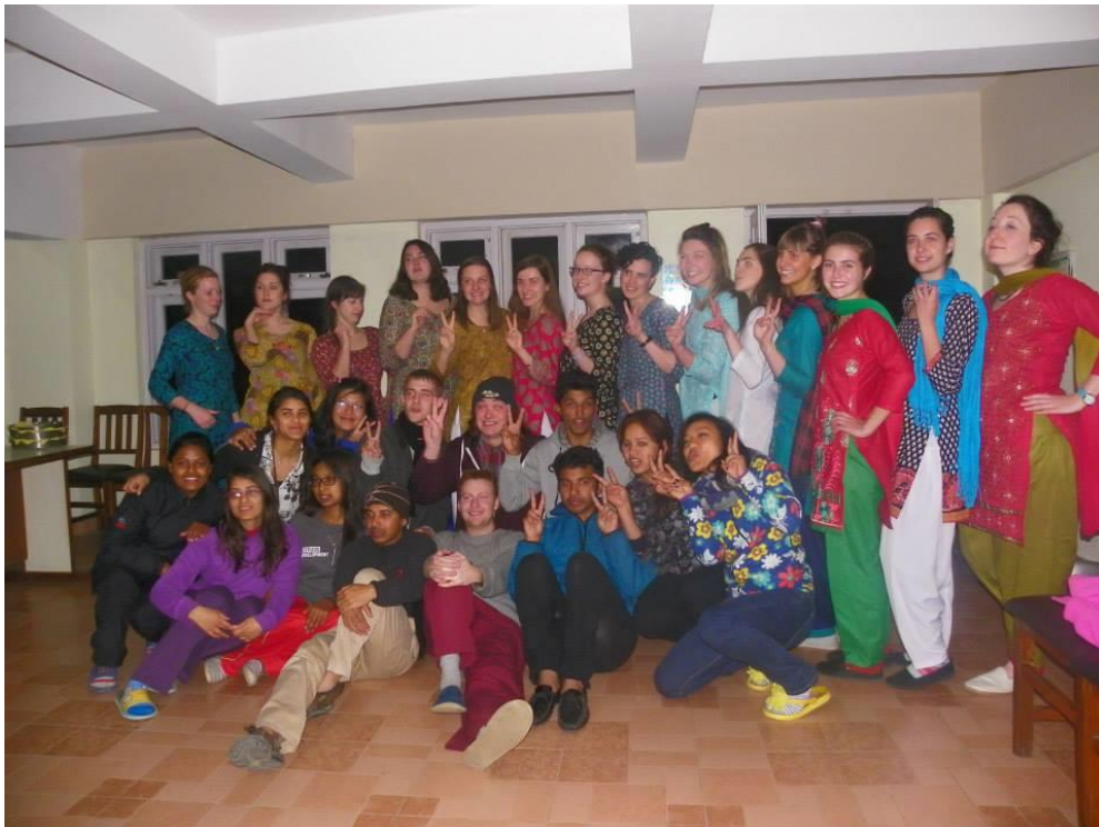
International and National Restless Volunteers (we have just had kurtas made and are showing them off)

I had little knowledge about Nepali Culture but was very interested to learn more about the country and its Hindu religion. The main thing I knew is that we would be eating 'Daal Bhat' and a lot of it! Curry for breakfast, I thought that's going to be weird! Upon my arrival into Nepal, I was surprised at how much pollution there was in Kathmandu and later to witness how rubbish disposal is also a huge issue even in the rural districts. I had some knowledge about caste systems but had never witnessed how this affects people directly and how lower castes can be discriminated against which is something we had to work around when delivering workshops. I assumed that girls would be quite reserved and dress accordingly so I took only loose clothing with me so that I wouldn't stand out or offend anyone. When we met the national volunteers, we were amused to find them wearing skinny fit jeans and t-shirts whilst we all looked like new age travellers with our low crotch baggy trousers. I hadn't thought about how the city dwellers might act differently to people living in smaller villages and was also really impressed by their level of English. When getting to know the nationals, we found out we all had a lot in common, music taste, hobbies, sense of humour and many shared questions about living in a 'rural placement' as many of them had never travelled so far from home before either.