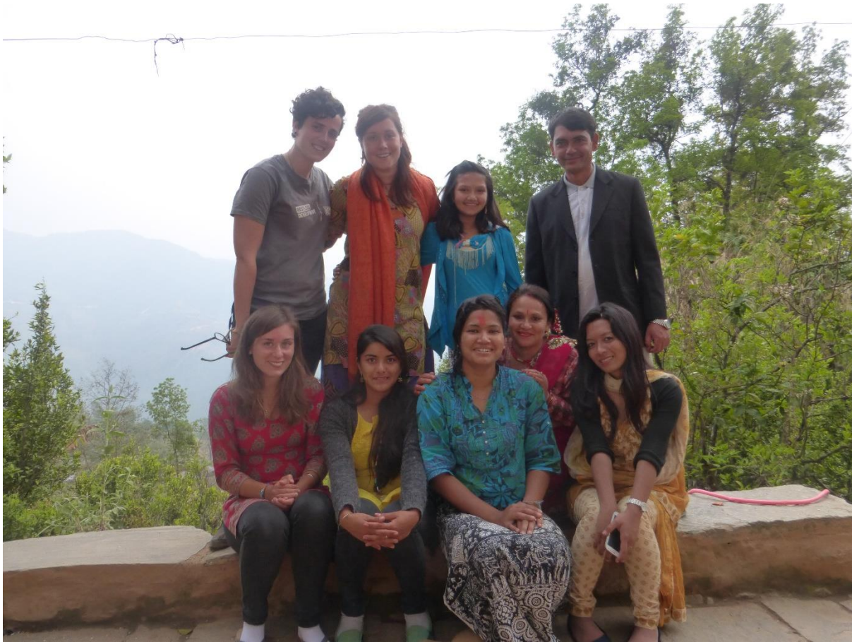
Living with my host family and other volunteers in Sunkhani, Nepal. I am second from the left at the top with the orange scarf.