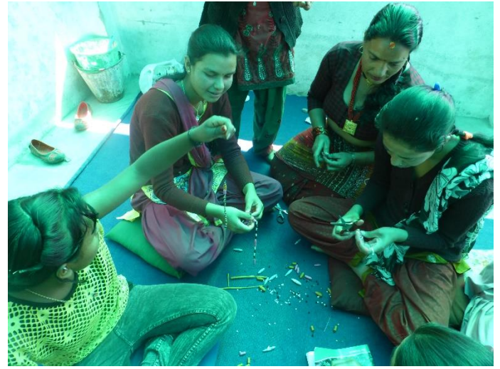
Handicraft sessions – Day 2 Jewellery making